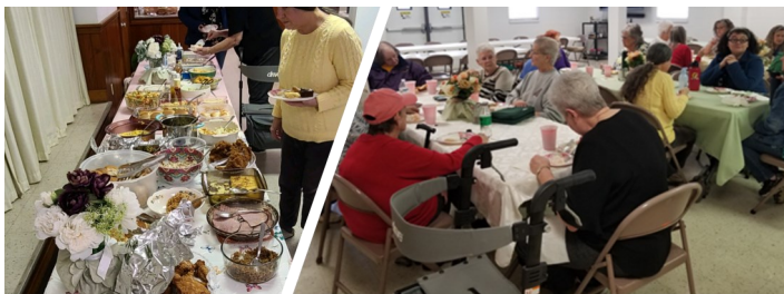
Ladies' Luncheon, March 23, 2024

Well...we got the girls together and had a great time. Just look at that spread! It was a "Baptist Ladies' Luncheon" for sure! Plenty of fine food, laughter and fun, including that "crazy memory game" (you had to be there). We proudly served what you brought and it was fantastic. If you missed it, please keep watching the calendar for our next exciting ladies' event. We want you there and we'll save you a seat!