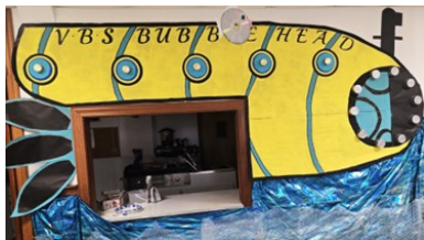
The VBS Bubblehead Café Submarine