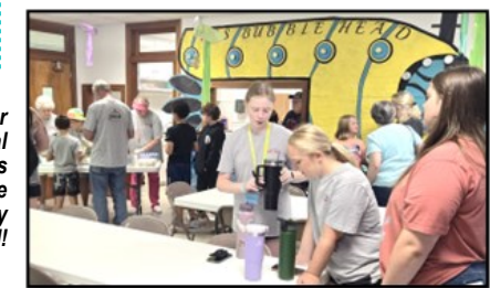
Our Tidal Treats were yummy good!