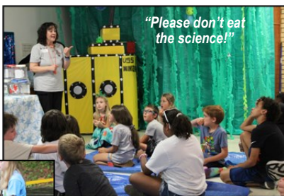
“Please don’t eat the science!”