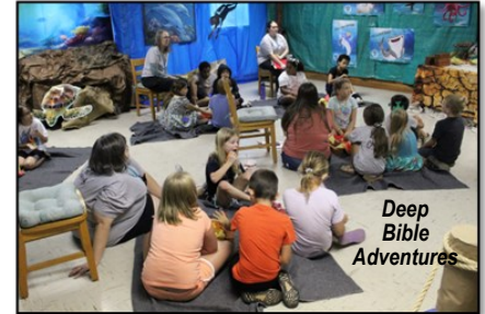
Deep Bible Adventures