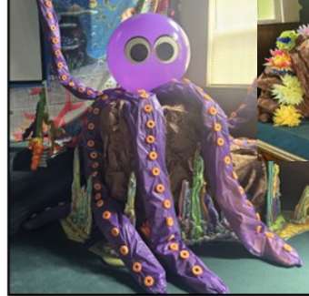
Coral Reefs teeming with life, even a submarine!