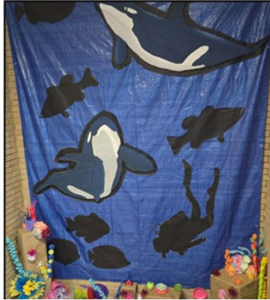
Life on the Coral Reef